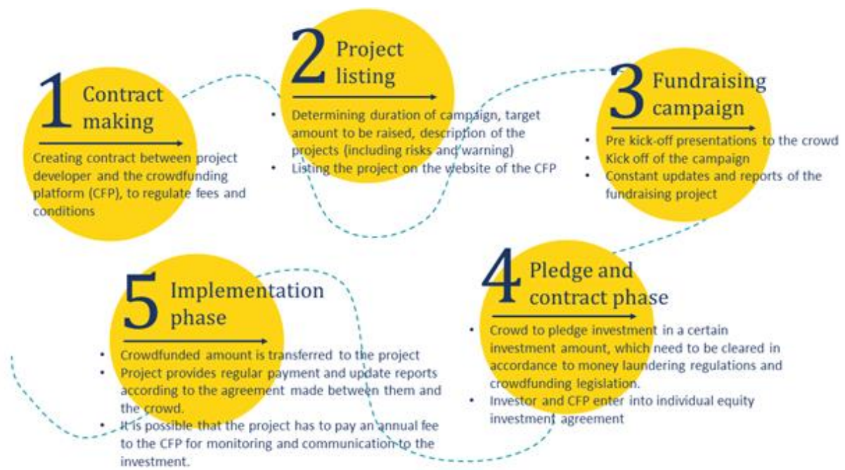
Figure 3. Step by step diagram of a crowdfunding financing scheme