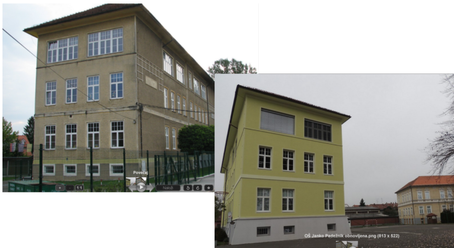
One of the 24 renovated public buildings in the municipality Maribor (primary school)

Koekelberg enhanced their wider capacities by using the existing framework which can link local governments together. They recognised the value of this relationship particularly when collectively engaged in finding financial support for energy saving schemes.