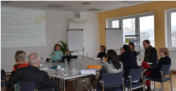
Participants discussing about EPC as an innovative financing scheme