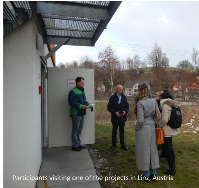
Participants visiting one of the projects in Linz, Austria